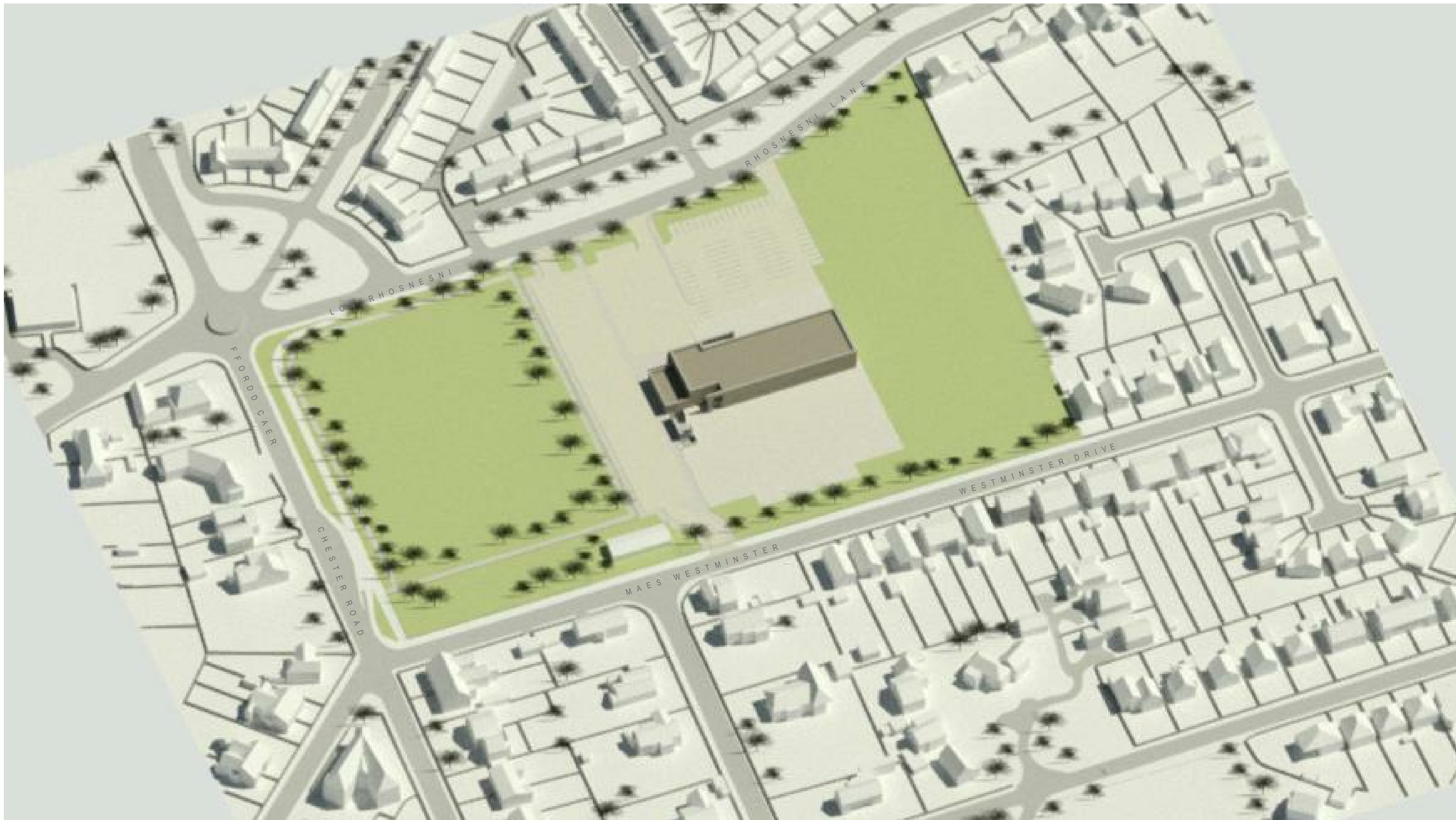
Golygfa tua De-Oriolewin View to South West