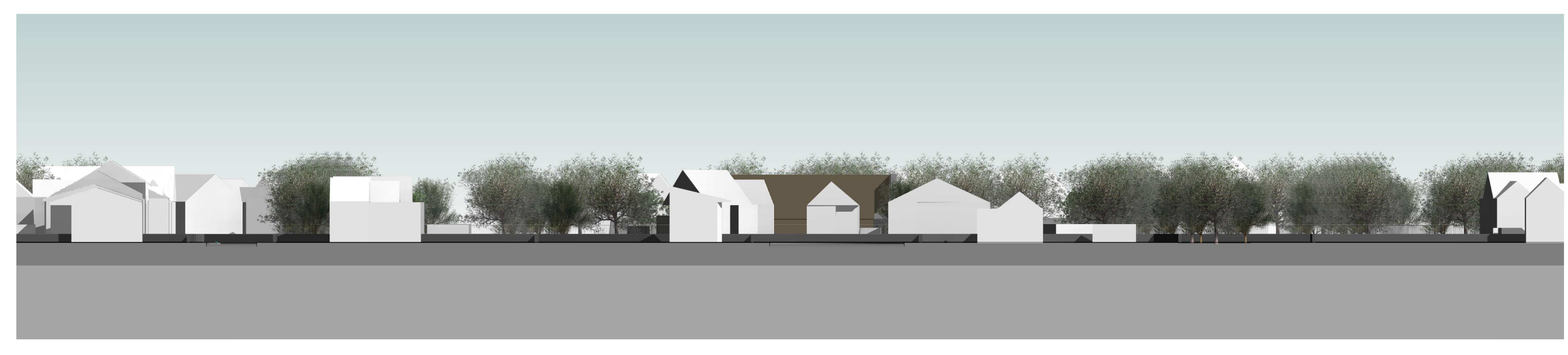
Drychiad Dwyrain o Ffordd Lawson - East Elevation From Lawson Road