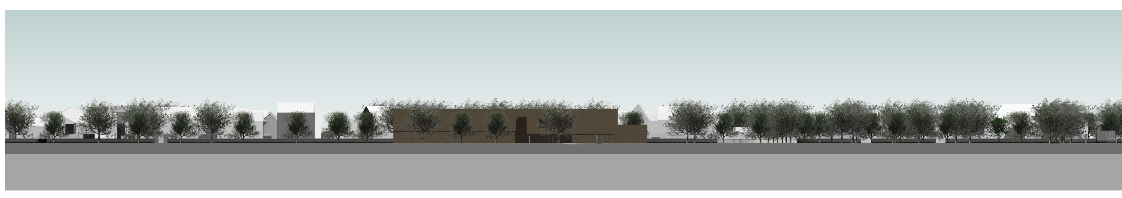
Drychiad Gogledd o Lon Rhosnesni - North Elevation from Rhosnesni Lane