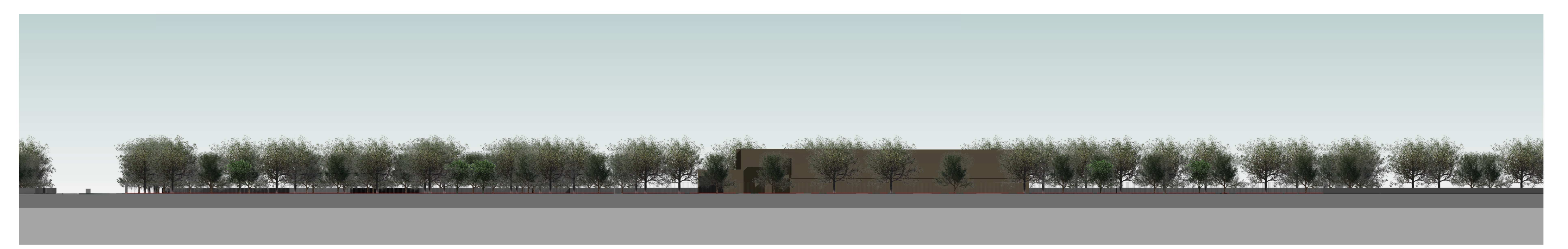
Drychiad De o Maes Westminster - South Elevation from Westminster Drive